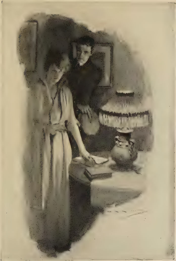
"THEN YOU CAME INTO MY LIFE"